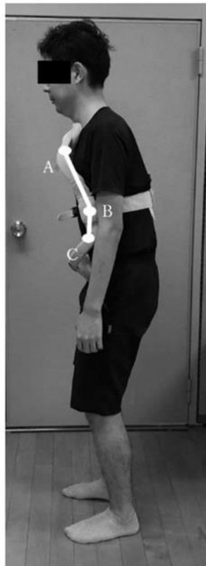
Fig 2. Set the angle between A-B and B-C to 160^\circ Adjust the length of A-B and B-C according to the target person.